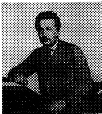
Fig. 1 Einstein as a Swiss patent clerk in 1905 when he revolutionized fundamental physics through the creation of the special theory of relativity.

The year 1905 has been called Albert Einstein's "Annus Mirabilis". It was during that year that he caused revolutionary changes in man's primordial concepts about the physical world: space, time, energy, light and matter. How could a 26-year-old clerk, previously unknown, cause such profound conceptual changes, and thereby open the door to the era of modern scientific technological world? No one, of course, can answer that question. But one can, perhaps, analyze some factors that were essential to his stepping into such a historic role.