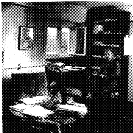
Fig. 3 Einstein in his study in his home on Haberlandstraße in Berlin.

single person, reminds me of the act of creation in the old testament. (And I wonder whether Einstein himself had thought of this comparison.)