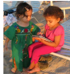
The youngest WOFE-07 participants focus on the Book of Abstracts

Close to sixty leading experts from academia, industry, and government agencies came to Mexico to report on the most recent and exciting developments in their fields. The warm and friendly atmosphere* was ideal for inciting the participants to exchange frank and sometimes controversial views on future trends and directions of the electronics and photonics industry.