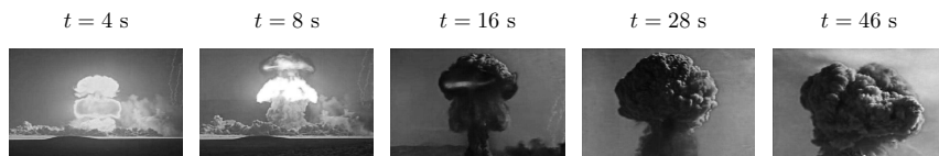
Fig. 1.1 Explosion of an American nuclear bomb in 1953. The time indicated above each image corresponds to the time elapsed since the explosion. The scale is the same for all photographs: 4 \text{ km} \times 2.5 \text{ km} .

Plasma frequency. One considers a gas of electrons (with number density n ) moving in a background of static ions, in such a way that the system is neutral. Find by dimensional analysis the expression of the characteristic oscillation frequency of this plasma.