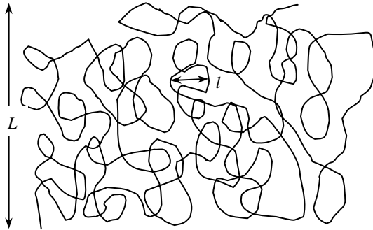
Figure 1. Field line of a random magnetic field. Self-intersections are caused by the projection effect. The correlation length l is much less than the global scale L .

If magnetostatic turbulence indeed exists, it may have significant implications for interpretation of a wide variety of astrophysical phenomena, from the behavior of hot matter in cluster of galaxies [6], to the dynamics of molecular clouds in HII regions (e.g., [7,8]). The magnetostatic turbulence would provide a high “stiffness” to the matter in such objects, without allowing the observer to detect easily the existence of the magnetic field. In particular, the synchrotron radiation will be un-polarized. Also, the Faraday rotation (that is proportional to the line-of sight integral) will be absent because of the randomness of the magnetic field. So, the hypothesis of the magnetostatic turbulence may help in resolving some of the observational paradoxes.